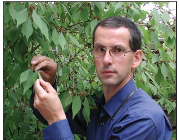
Disillusioned. An expert on the evolution of pathogens, Dieter Ebert doubts that virulence management can work.

Ewald argues that in places with poor sanitation, cholera can make hosts deathly ill but still find new hosts. As a result, it will evolve to high virulence. On the other hand, in places with protected water supplies, that route is cut off. The bacteria’s only option